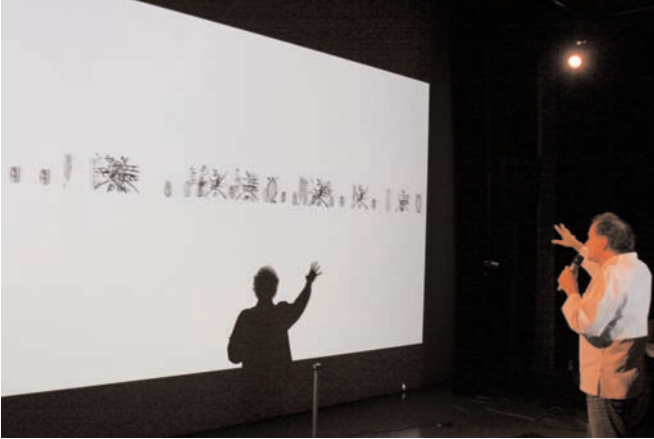
Demonstration of "Les maîtres invisibles" by Rachid Koraïchi - Work in progress - 2008 / Le Cube

Le Cube, the first cultural space dedicated entirely to digital creation , opened its doors in September 2001. Created at the initiative of the city of Issy-les-Moulineaux , ICT pioneer in France, Le Cube is managed by ART3000 , an association that has been involved in the field of digital arts since 1988.