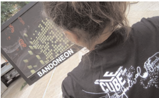
"Bandoneon" by Xavier Boissarie and Roland Cahen / Cube festival 2008