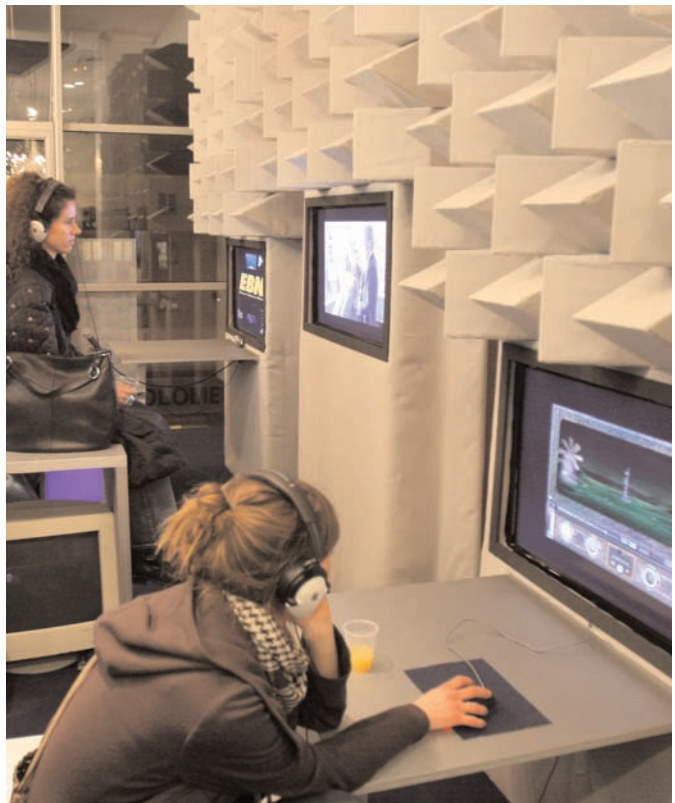
Exhibition "Optronica - Hybridations sonores et visuelles" - 2008 / Le Cube