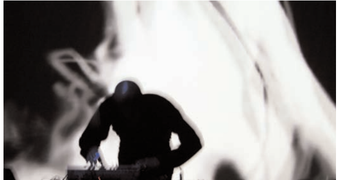
Mix A/V by Mimetic - 2008 / Le Cube

Learning, practical experience, exchange... digital creation invites us to discover and own the new means of expression as a way of remaining in responsive to change, in touch with the present and keeping a step ahead.