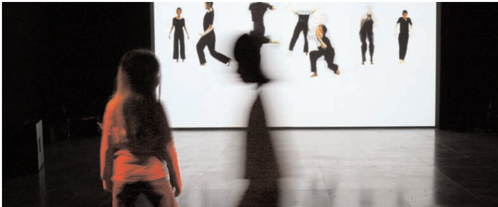
"Music Box" by PJ Pargas - Workshop - 2007 / Le Cube