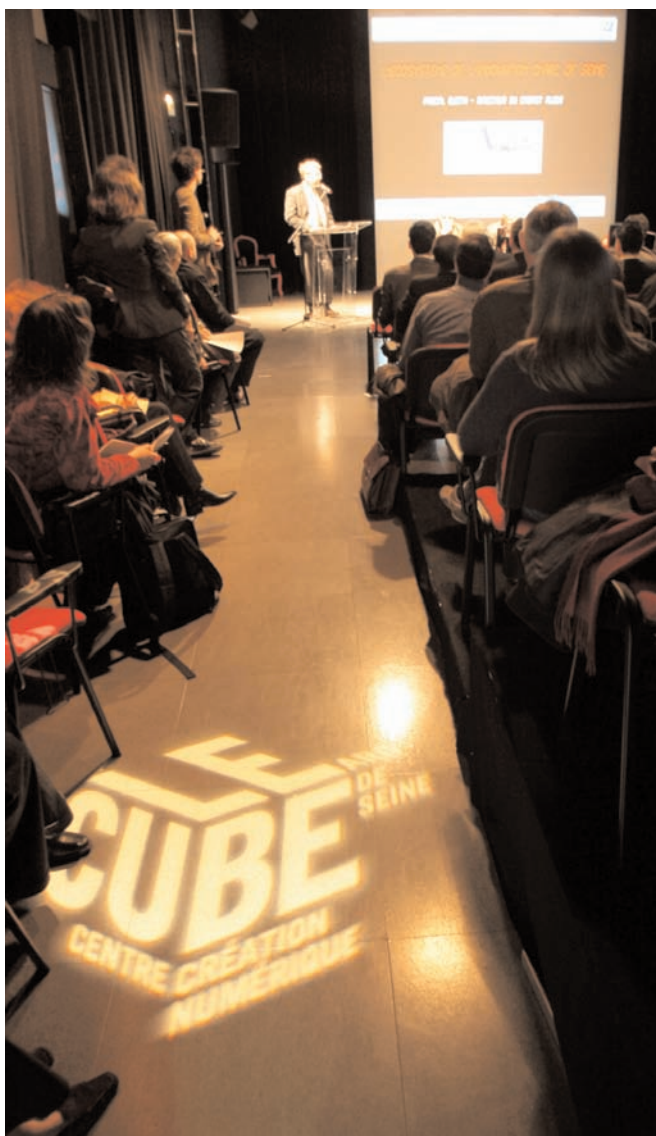
Conference "Creation - Innovation" - 2008 / Le Cube

Numerous public and private organisations have supported the activities of ART3000. They include: the Ministry of Culture, UNESCO, the European Council, the European Commission, the Ministry of Foreign Affairs, the Ministry of Industry, the Ministry of Research, the French Education Department, the Quebec Arts and Literature Council, SACD, SACEM, SCAM, ASDARP and the Ile-de France Regional Council, the Centre National de la Cinématographie (French National Cinematography Centre).